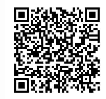
Scan for more info