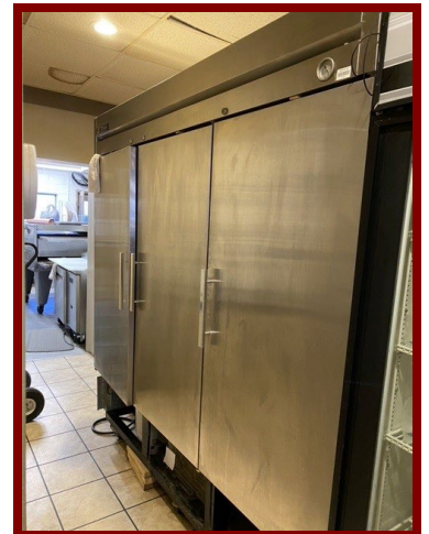
3 Door Freezer