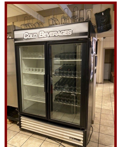
2 Door Fridge